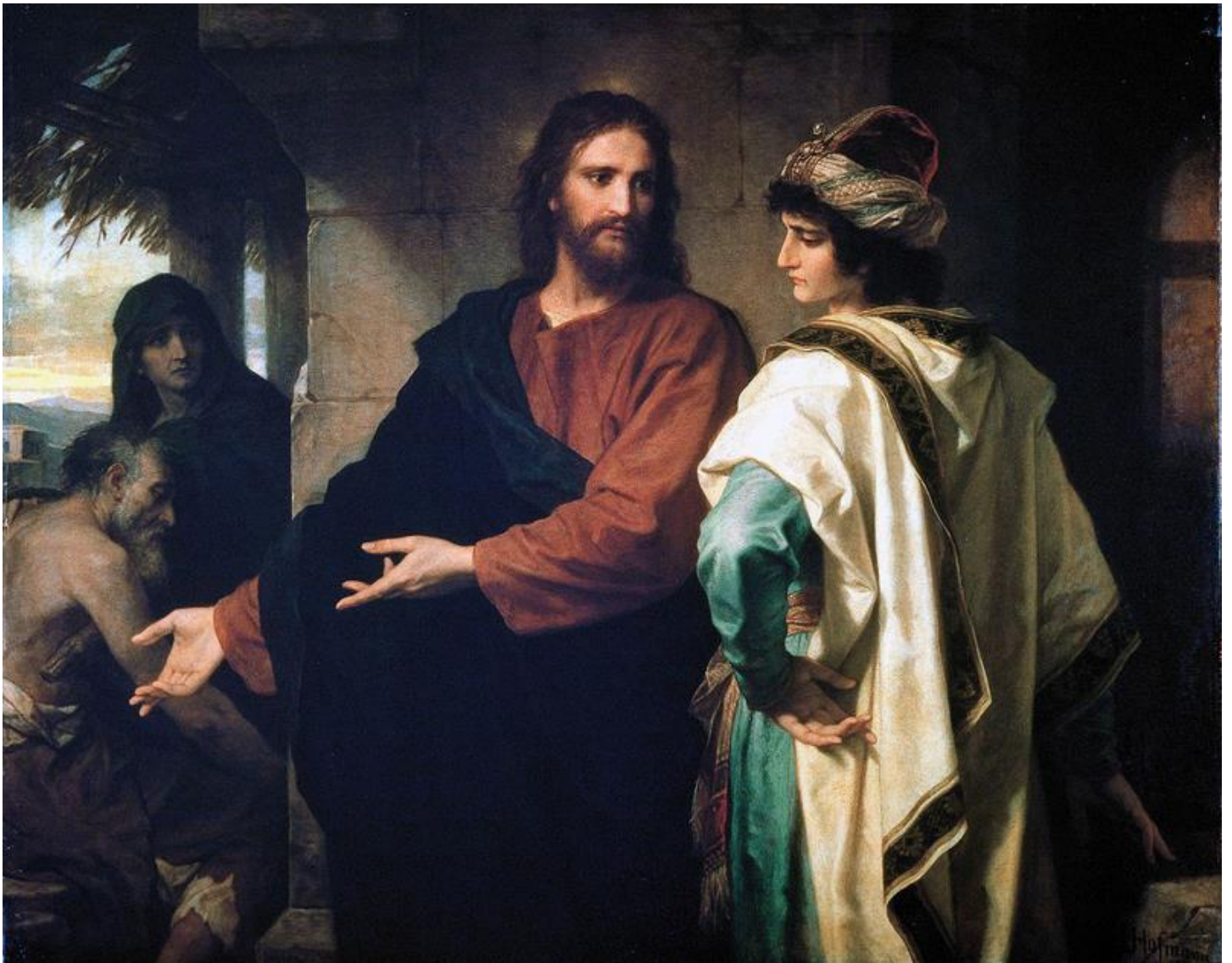
Christ and the Rich Young Ruler – Heinrich Hofmann (1824-1911), Riverside Church, NY, USA

TWENTIETH SUNDAY AFTER PENTECOST 10 October 2021 11:00am MORNING WORSHIP & SERMON